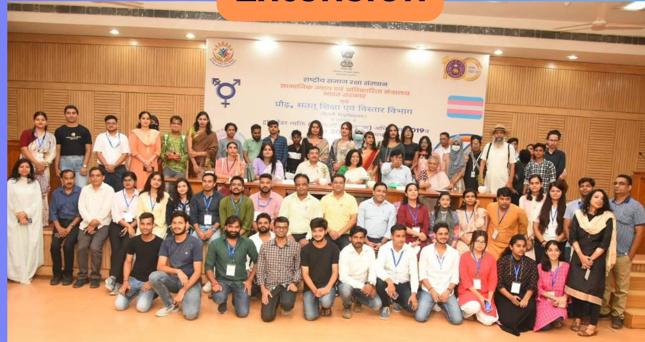
Advocacy & Sensitization program on Transgender Act, 2019 with support of NISD, MoSJE. Over 100+ transgender person were participated.

Department of Adult Continuing Education & Extension has constituted the Transgender Resource Center to provide several support to these marginalized community.