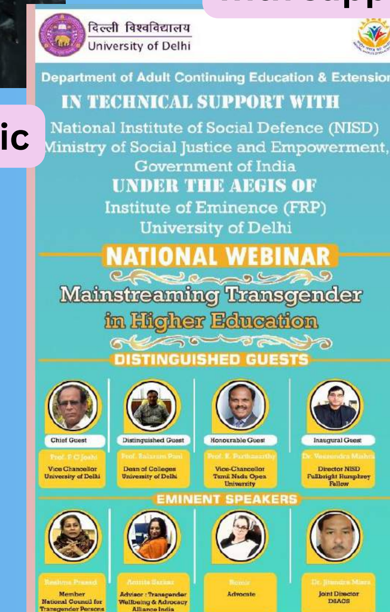
Online session on mainstreaming Transgender community in higher education