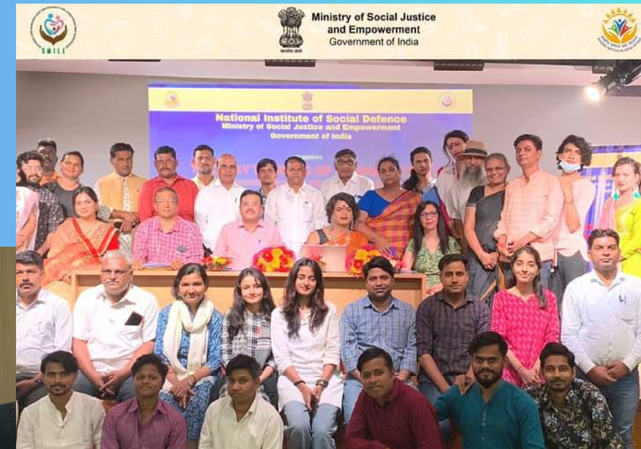
Training session of master trainers is organised with support of Ministry of Social Justice and Empowerment, GoI