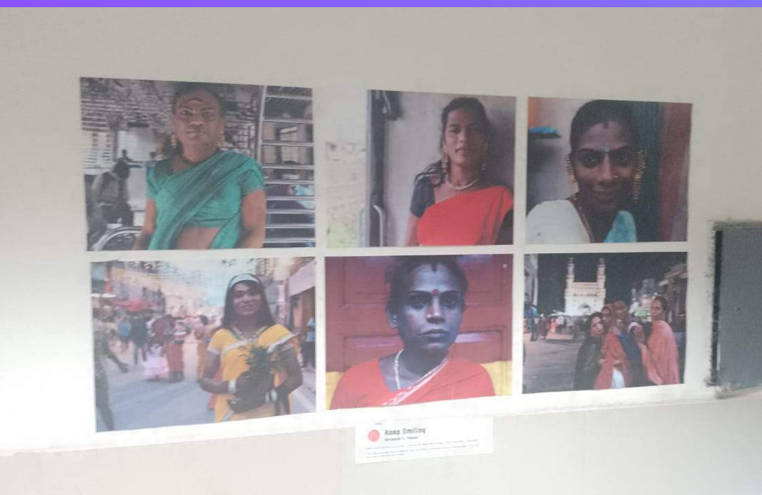
Arts collection at National Skill Convention of Transgenders