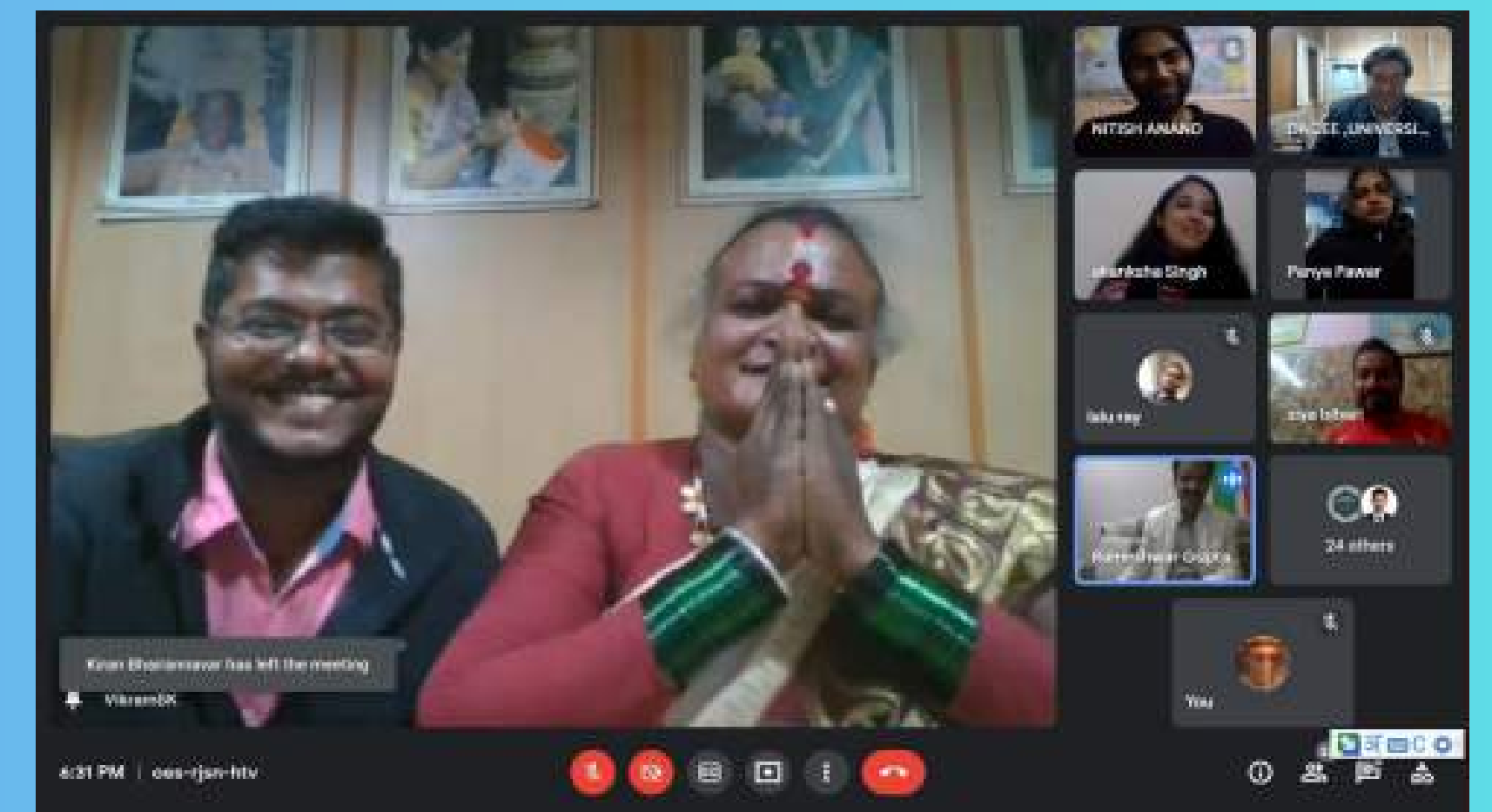
An online workshop on Advocacy of Transgender persons (Protection of Rights) Act, 2019 with Padma shri awardee, folk artist Manjama Jogathi (transwoman)