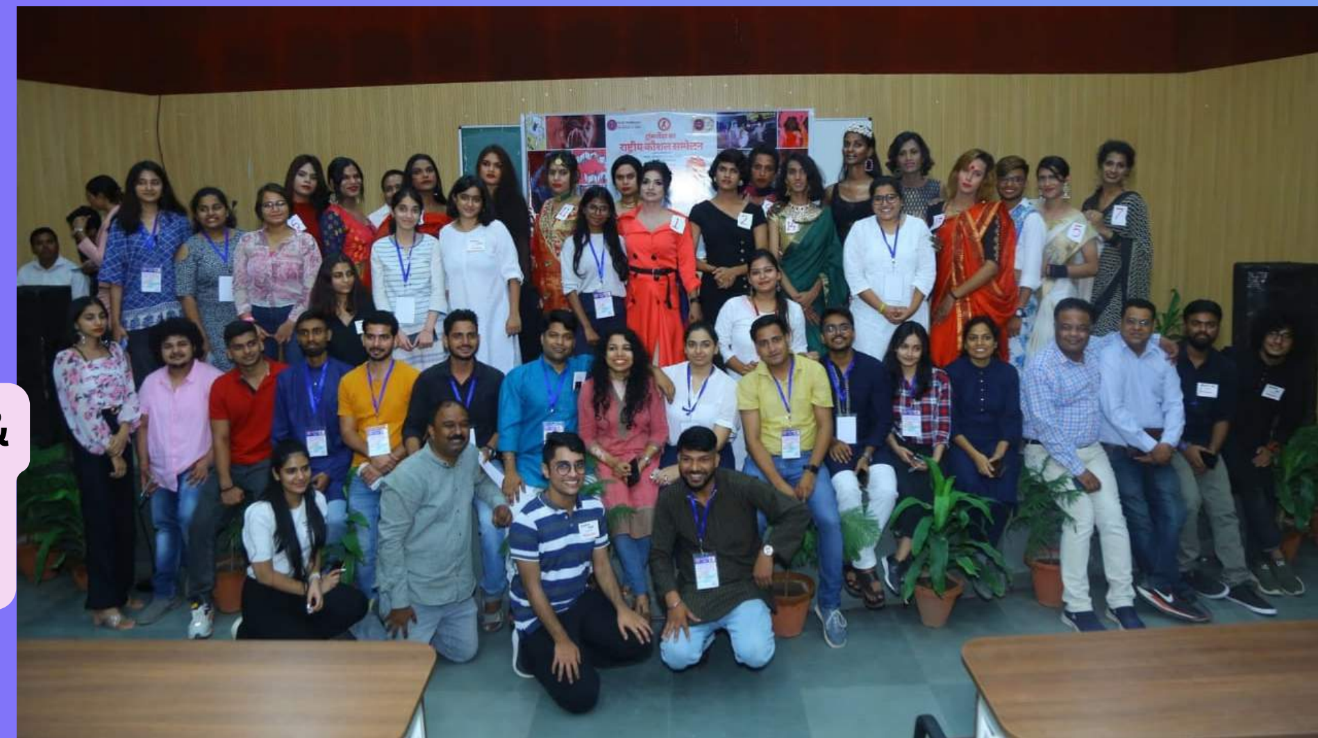
A National skill convention is organised to promote skill enhancement and economic empowerment of Transgender community.